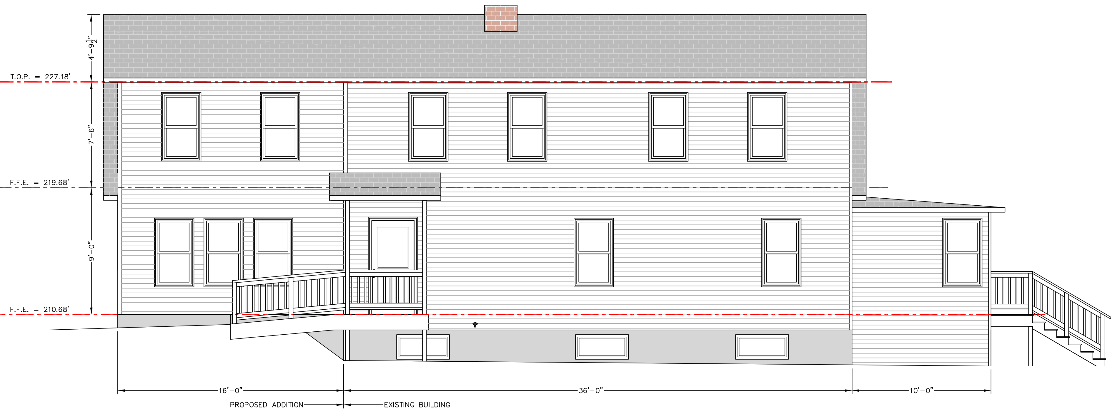
LEFT SIDE ELEVATION SCALE 1/4" = 1'-0"